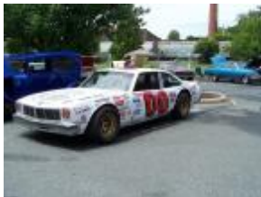
Even mother nature couldn't stop us from a great show.