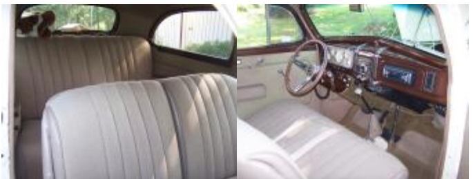
1937 interior after modification and as shown in The original owners manual.