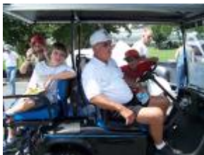
August 22, 2009