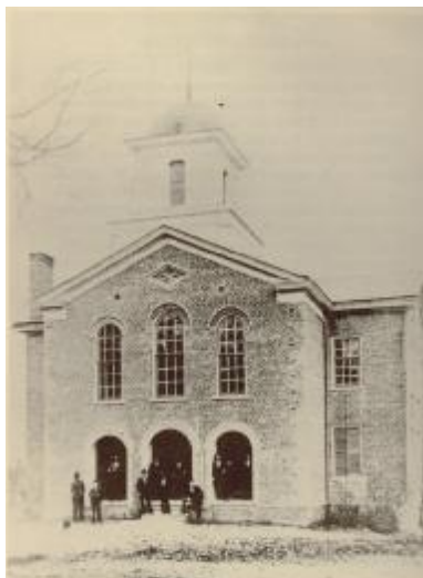
Asheboro Court House, 1835

Email: zooland@bellsouth.net Web: www.local.aaca.org/zooland Fax: 419.441.0530